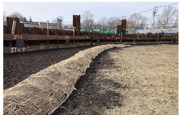
Topsoil and Bank Restoration along Mire Brook bank