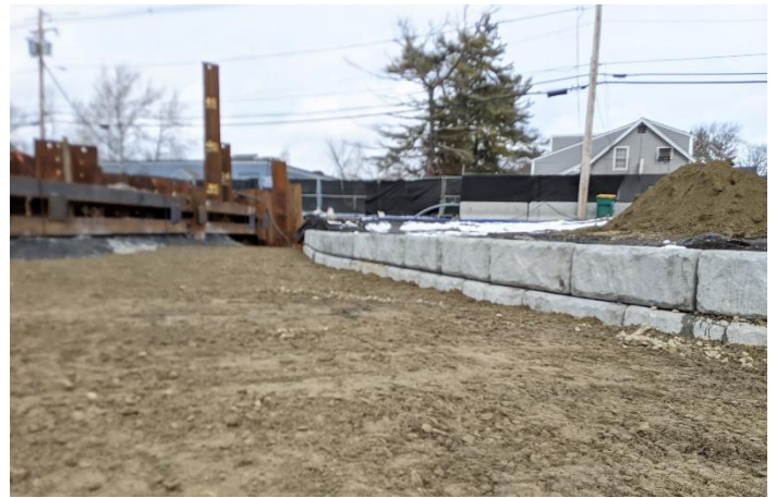
Retaining Wall Construction along Mire Brook