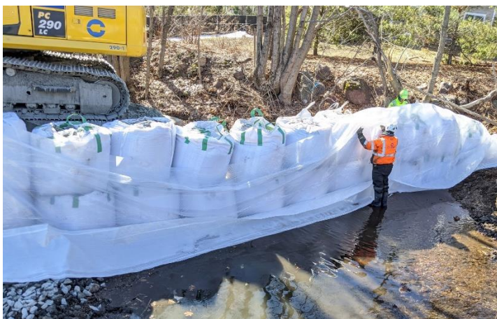
Ten Mile River Bypass Cofferdam Placement