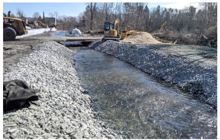
Ten Mile River Bypass Channel